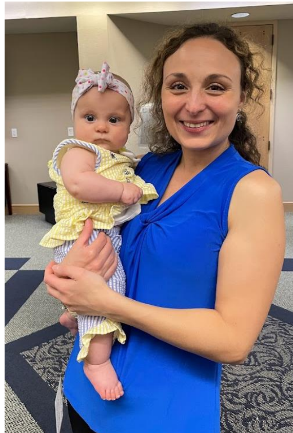
Youngest member of Sherwood