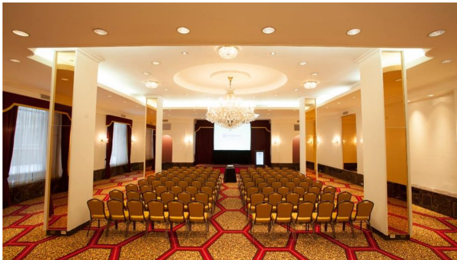
2025 Sherwood Conference Venue at the Wyndham New Yorker Hotel