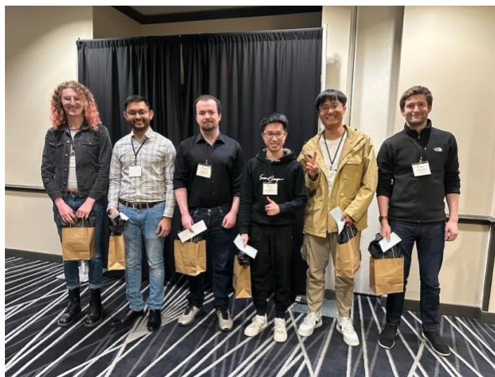
2024 Student Poster Award Winners