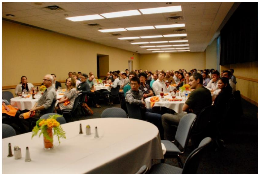
2023 Sherwood Reception